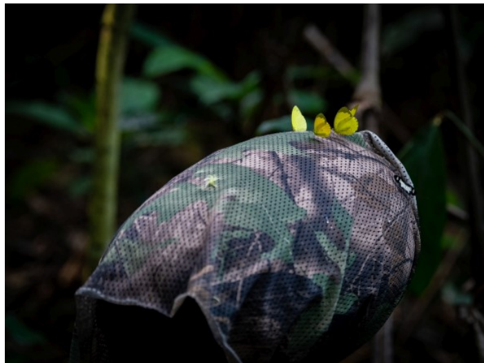
One of George's perfectly camouflaged mic set-ups

A great deal of time goes into planning of these exotic trips; Vlad does extensive risk assessments and has completed first aid and remote medicine courses to mitigate as much as possible. His expedition to Gabon, for example, took eight months of preparation, one month on location and up to six months of post-production. Seemingly no task is too challenging for Vlad however, such as travelling to the Congo by flying to Gabon and then continuing by car. "And hiring a car in Gabon is more expensive than buying it outright, but as a Westerner you are not allowed to buy a car or even drive outside the capital," he says. "I've built my expeditions one on the other and very slowly pushed my comfort zone, so I've never been really far outside it. There have been situations where I've felt a little threatened. My friend and I were the only westerners in the Congo rainforest and sometimes the locals weren't so excited for us to be there; we didn't know the local mores, or social norms. But then I sometimes think it can be way more dangerous in Central London than in the Congo rainforest!"