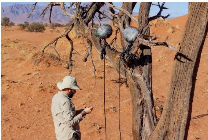
George’s favourite recording rig employs four MKH 8020s placed around a tree – a head-related recording

Whilst location recordings often require innovative approaches, Vlad has a very unusual method of capturing in-the-wild surround sound: “My favourite rig to record with is four MKH 8020s, placed around a tree. It sounds a bit cheesy, but it gives me the perspective of the tree listening to the environment in 360 degrees. Of course, a tree doesn’t listen to anything. But if you think about the grooves and the texture of the bark, it’s something like head-related trans-reflection, like your nose, face and its contours. The sound bouncing round the tree colours it in a certain way. So listening from the tree’s perspective in the rainforest is my ultimate recording technique and I will use it whenever possible. The low noise floor, high build quality and excellent bass response of Sennheiser 8020s comes in handy when recording in the wilderness. And they perform exceptionally well in extreme humidity, especially when you look at the competition.”